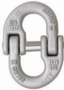
A-1337 10 Alloy Connecting Link

* Proof tested at 2 times Working Load Limit. Ultimate Load is 4 times the Working Load Limit.