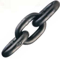
Spectrum® 10 Grade 100 Alloy Chain