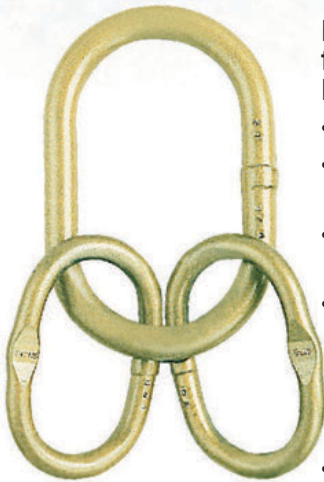
A-347 Welded Master Link with Engineered Flat

Ratings below are for use with chain slings fabricated in accordance with ASME B30.9. For other applications, see page 163.