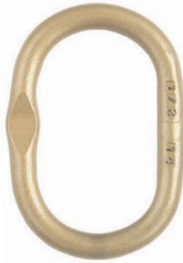
A-344 Welded Master Link with Engineered Flat

Ratings below are for use with chain slings fabricated in accordance with ASME B30.9. For other applications, see page 162.